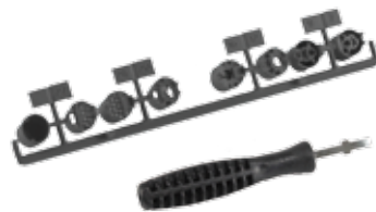
Nozzle Tree & Tool

Note: Data collected in zero wind conditions